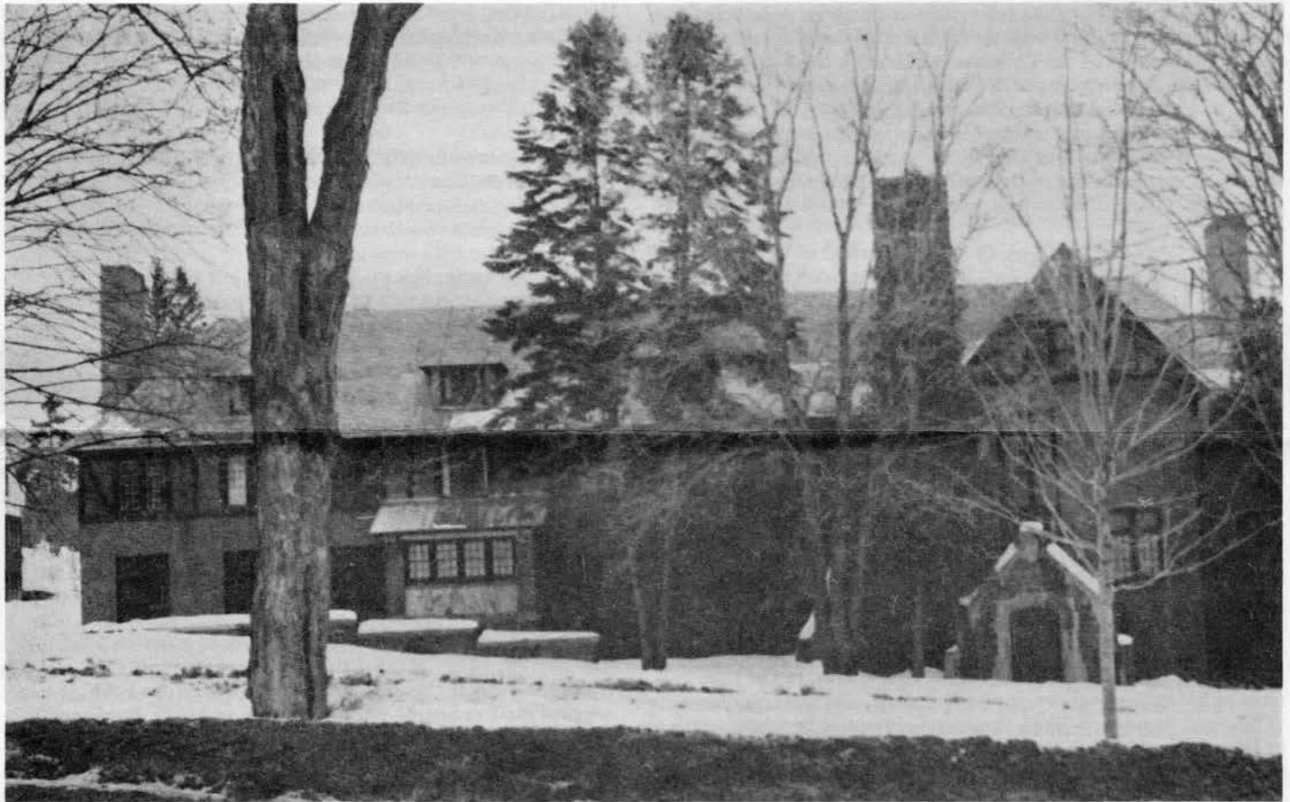
The Psi Chapter in Winter.