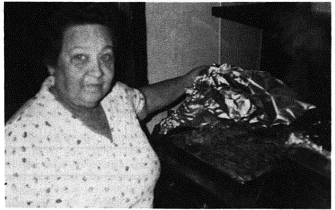
Ma reveals some of her fine cuisine.