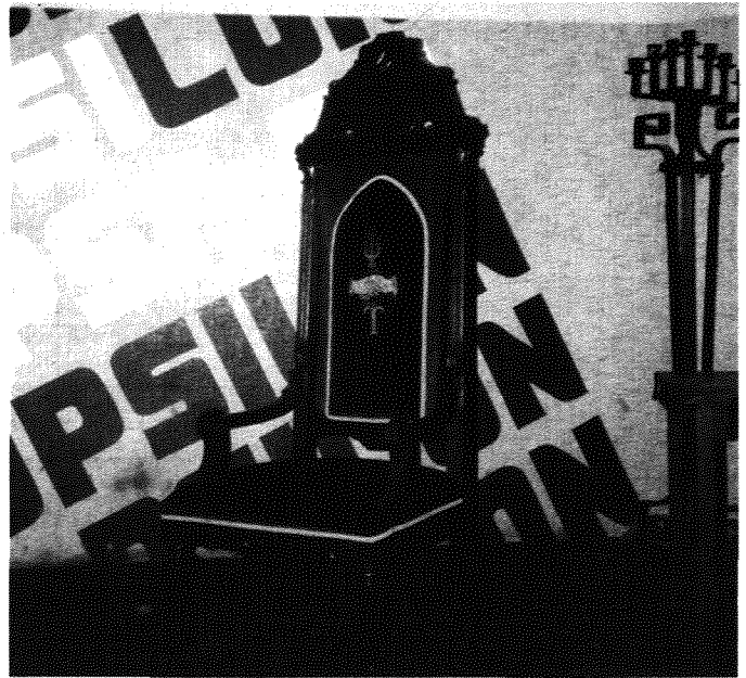
Newly redone president's chair.