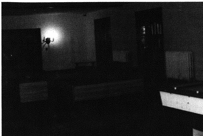
The refurbished bold great hall.