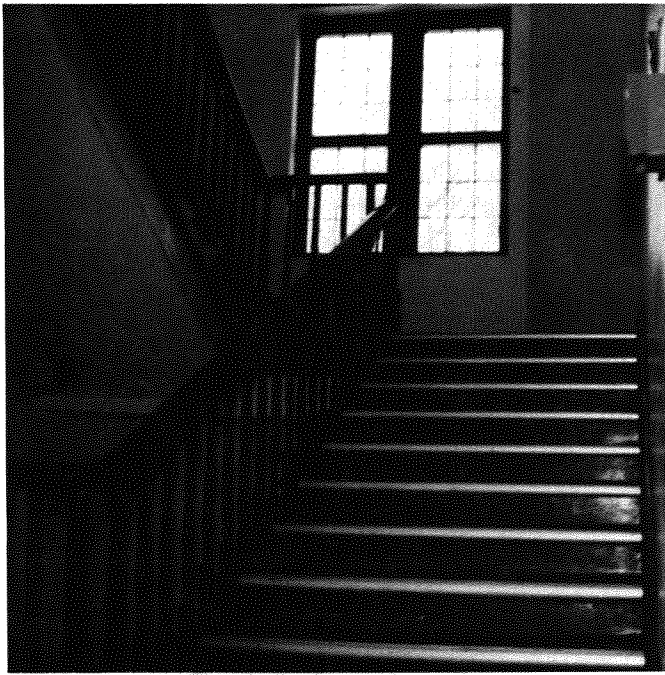
Our newly installed stairs.