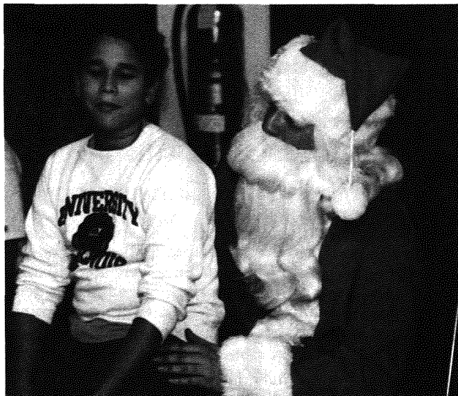
Come on now, tell Santa what you want for Christmas.