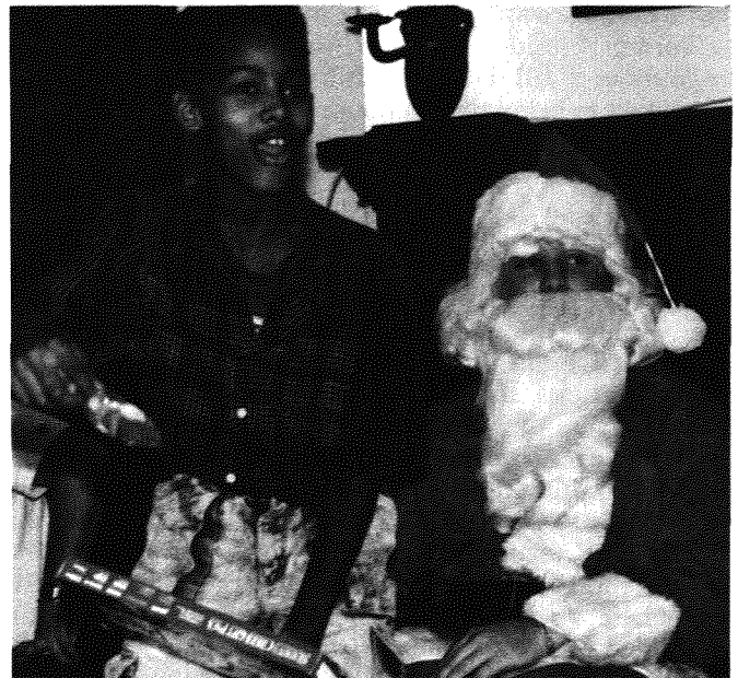
Our PsiU Santa hands out gifts at the Christmas party.