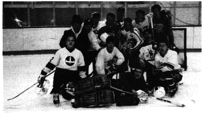
The bold Psi U pucksters had a great season.