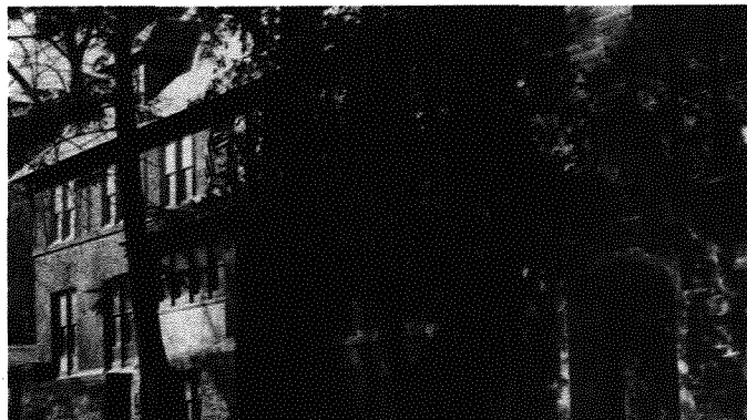
Old Glory flying from the Psi in support of our troops.