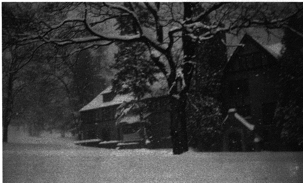
The bold house endures during the winter.